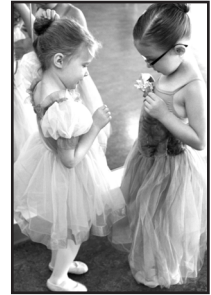
"Must love to dance, dress up and make new friends"