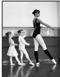
"Position your child for success"

Ambition Performing Arts has added new teachers and administration to its staff for the fall. Educationally, parents are very impressed with the staff. The school has over 20 staff members, all teachers hold current teaching certifications and many hold university degrees, or are currently enrolled in University. The dance school handles everything from 0 years (parented) old, beginners, recreational and pre-professional university level students. Due to the number of teachers on staff, students are all well matched to a teacher that will best suit their needs and who will relate well to them.